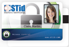
RFID cards: 125 kHz 13.56 MHz / UHF