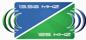
HYBRID cards 125 kHz + 13.56 MHz