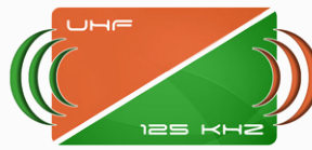
HYBRID cards 125 kHz + UHF