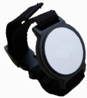
Prox wristbands BMS