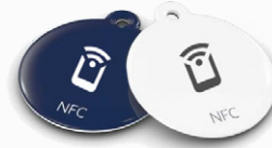
NFC stickers ETS