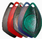
Design Prox key holders - PCD