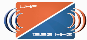
HYBRID cards 13.56 MHz + UHF