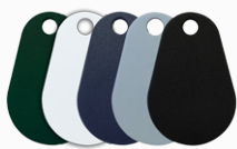
Graphic Prox key holders - PCG